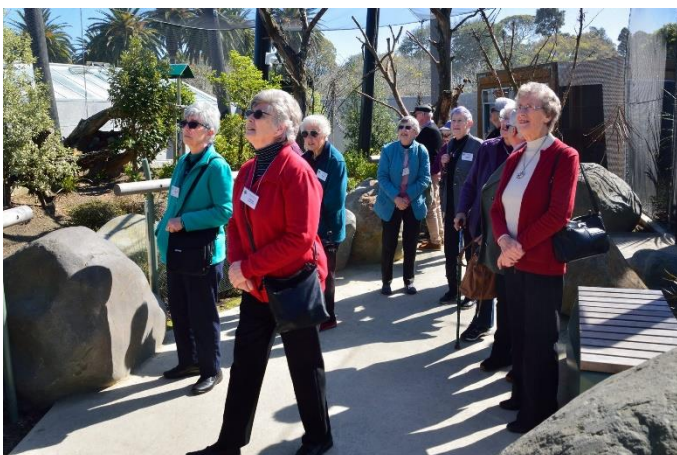
Massey University Wildlife Recovery Centre