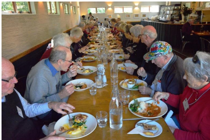
Elm Cafe – Palmerston North