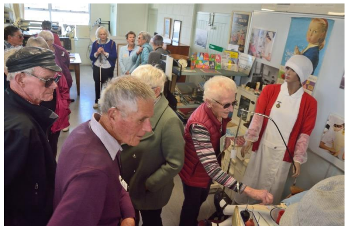
Palmerston North Hospital Medical Museum