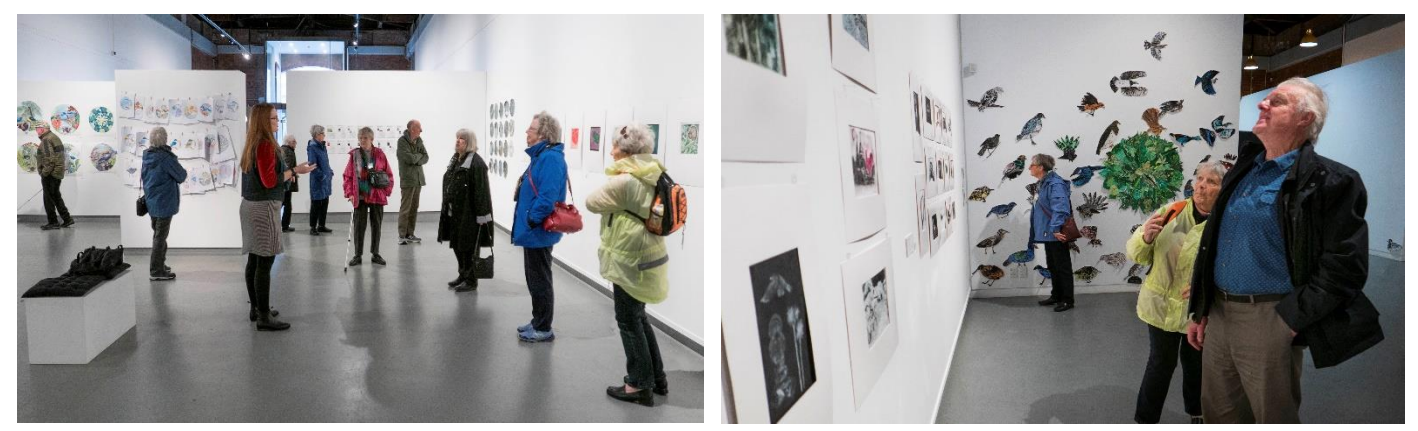
Visit to the National Portrait Gallery in July