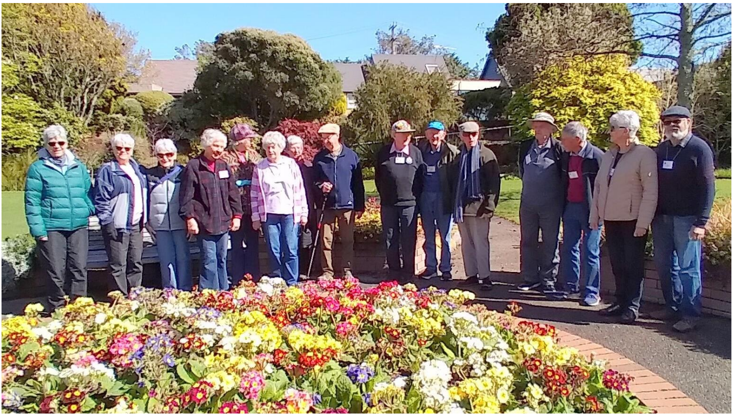
WALKING GROUP IN THE DELL AT PARKWOOD