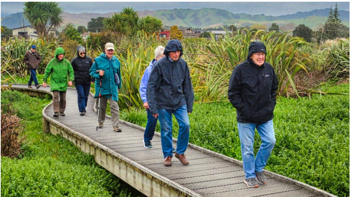
INTREPID WALKERS BEATING THE ELEMENTS