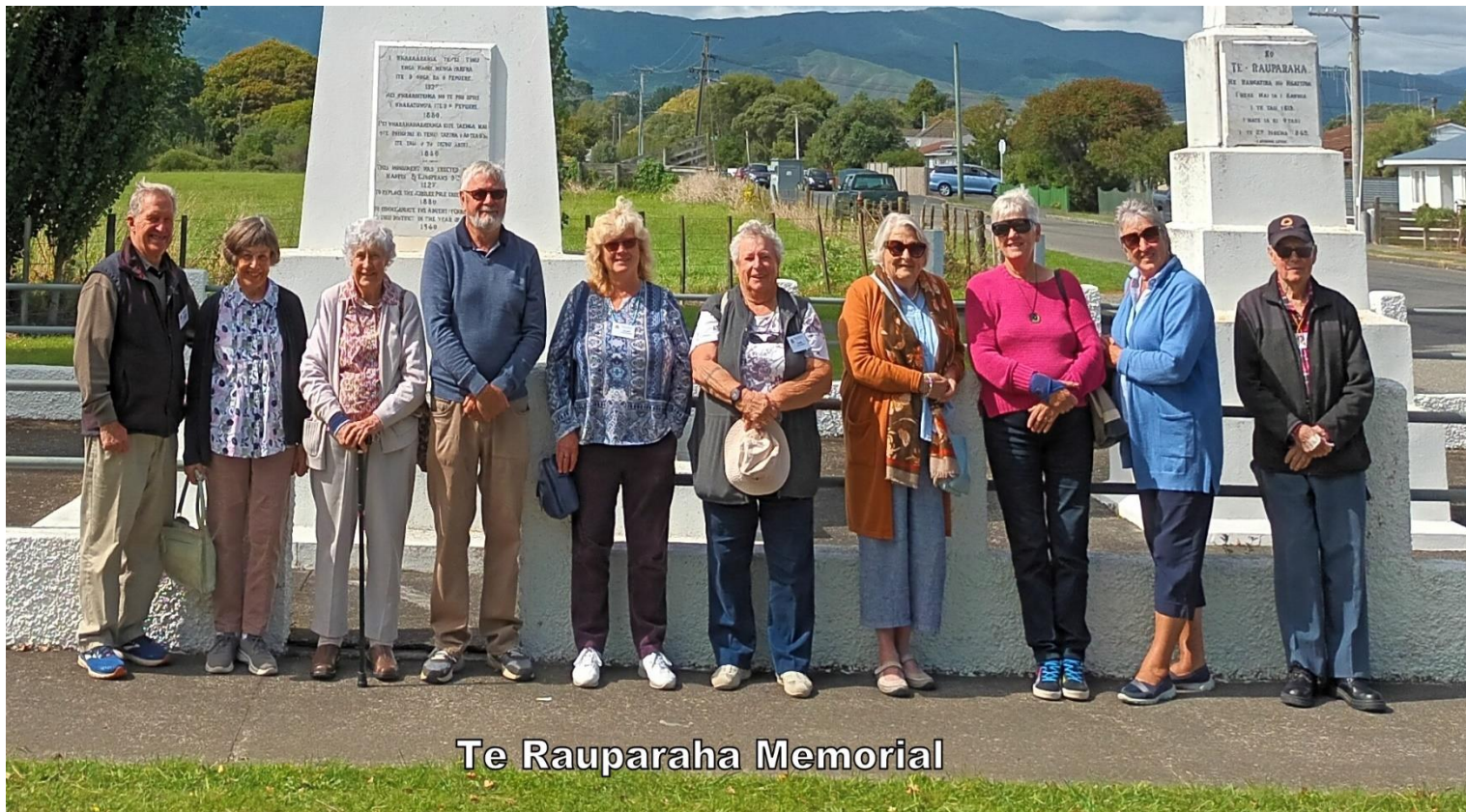
Te Rauparaha Memorial