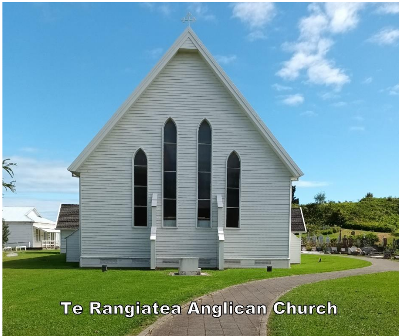
Te Rangiatea Anglican Church