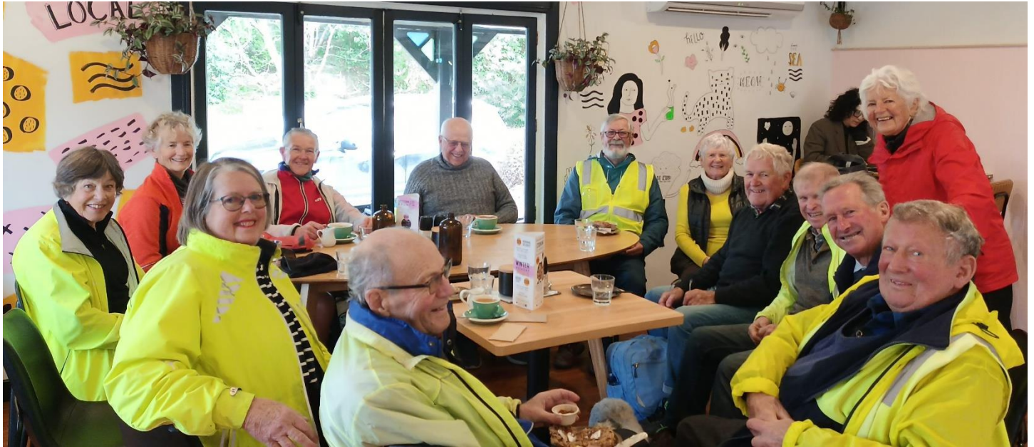
Happy to be warm and enjoying the Sunday Cantina's hospitality